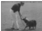
4. Click and reward your dog when he reaches you