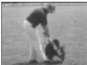
3. Back up as you bring your treat hand close to your body