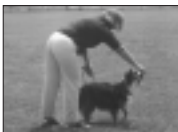
2. Hold the treat in front of your dog's nose when he becomes distracted