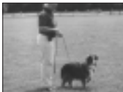
1. Starting position