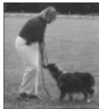
4. Bring your treat hand close to your body before you click and reward your dog