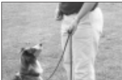
2. Quickly press and release