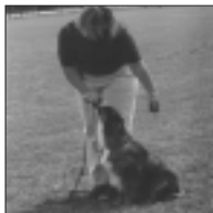
3. Click and reward your dog the moment he sits