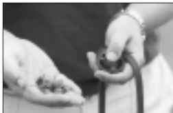
1. Hold both the leash and Quick Click™ as shown

Practice Clicker Conditioning for two (2) training sessions.