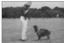
3. Bring the treat up to your face. Click and reward your dog when he makes eye contact