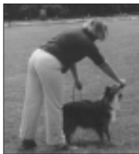
2. When your dog becomes distracted, hold the treat in front of his nose