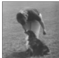
4. Make training fun! Praise your dog at the end of each exercise