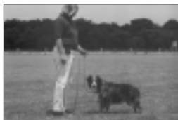
1. Starting position - Note loose leash

Practice Clicker Conditioning with Attention for two (2) training sessions.