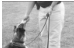
3. Immediately give your dog a treat following the clicking sound