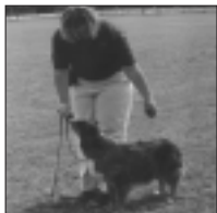
1. Hold the leash and treat in the same hand

Note: There is no need to pair a command with the Sit for the first two (2) training sessions. Adding the command after your dog has an idea of what to do, makes it easier for him to learn the Sit command. You will find that the same principles apply to Come Back When Called.