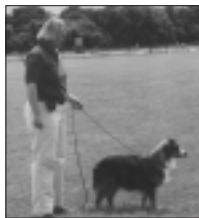
1. Starting position - Quick Click™ and leash are in the same hand