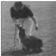
2. Raise your treat hand in an upward arc