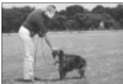
2. If your dog becomes distracted, hold the treat in front of his nose